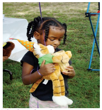
A little girl is playing with the stuffed animal she received from the U Care's Resource Table.

the many agencies represented at the event. Children visiting our tables had a choice of a stuffed animal compliments of the Bee Hive Thrift Stores or a coloring book and crayons. Parents were given literature about U Care's services and the child advocacy program for children of domestic violence. The children appreciated the gifts and seemed to have fun with